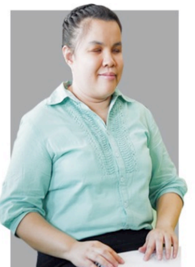
Maintaining A JOB