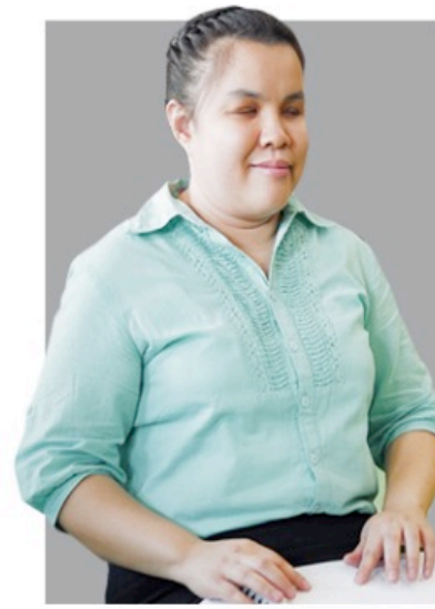
Maintaining A JOB