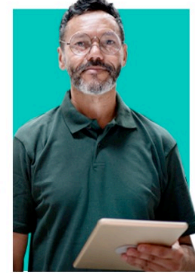
Changing OR LOSING A JOB