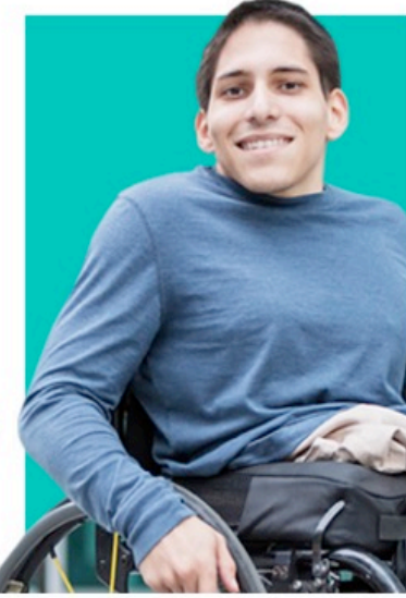
Starting A JOB